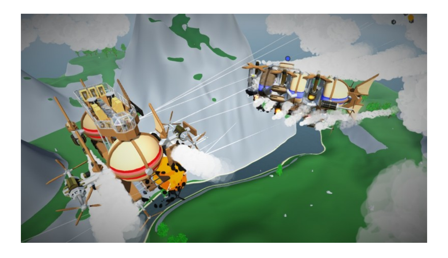
Download ->>> <a href="http://bit.ly/2NFjj3K">http://bit.ly/2NFjj3K</a>